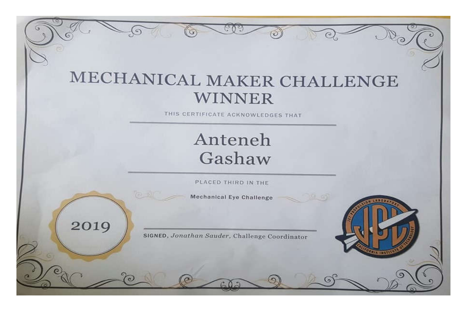
Figure 12 – NASA / JPL winners' certificate

I have invented a mechanism that will solve the hurricane crisis of the USA for good and I am looking for a department to submit my white paper which you can see via <a href="https://www.herox.com/ideas/128-solving-us-hurricane">https://www.herox.com/ideas/128-solving-us-hurricane</a> and few of my honorary certificates are shown below.