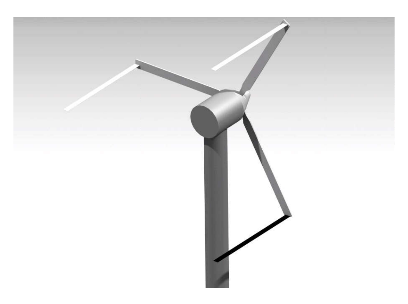
Figure 8 – rotating wind turbine and with wind presence