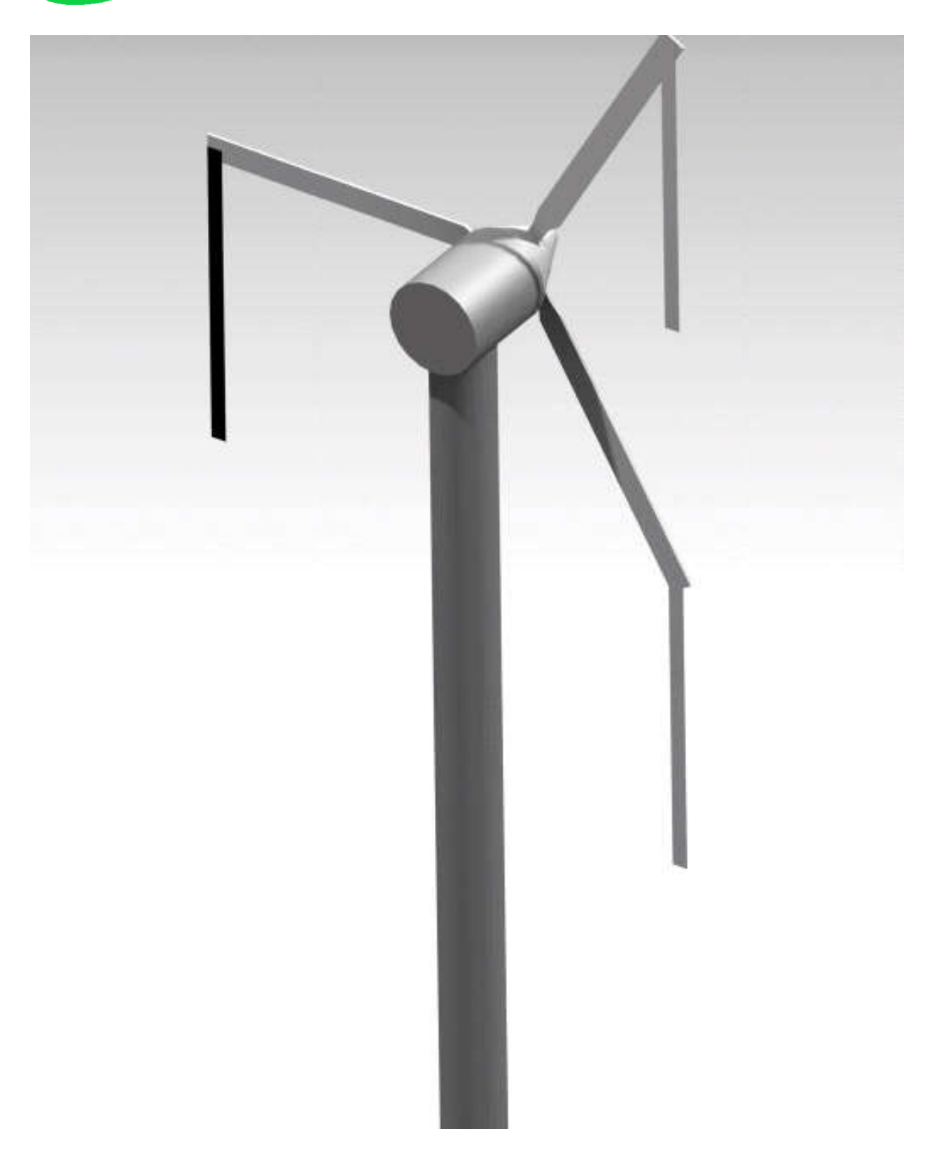
Figure 2 – wind turbine at stationary and no wind