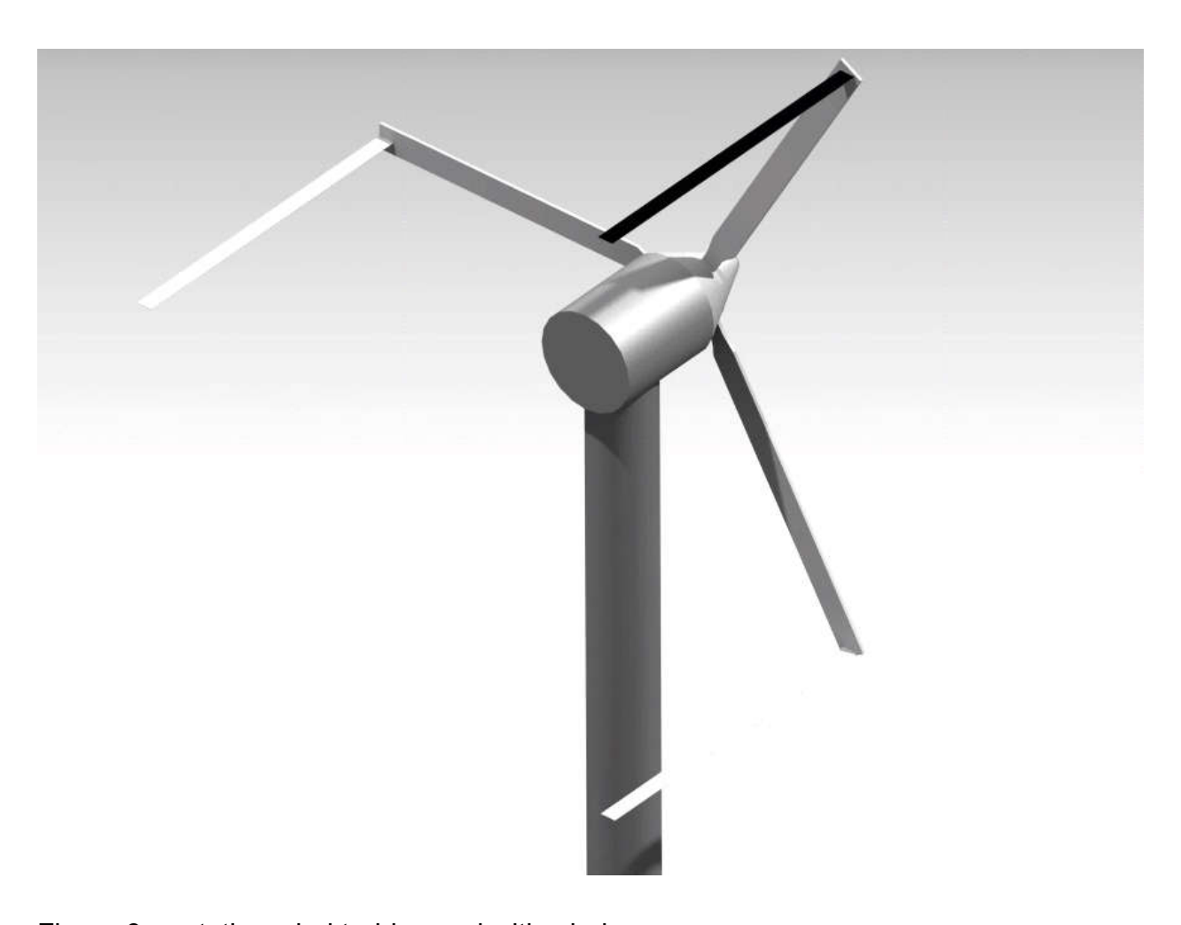
Figure 6 – rotating wind turbine and with wind presence