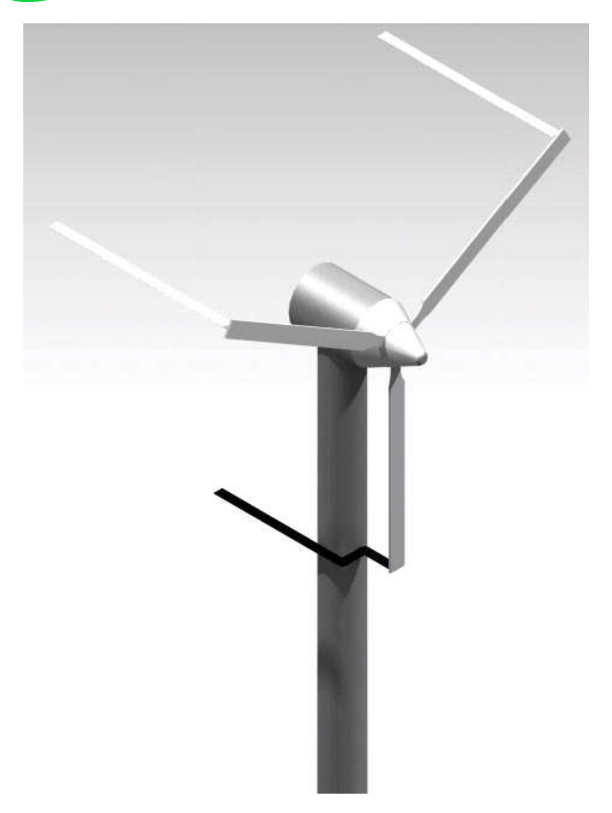
Figure 9 – rotating wind turbine and with wind presence