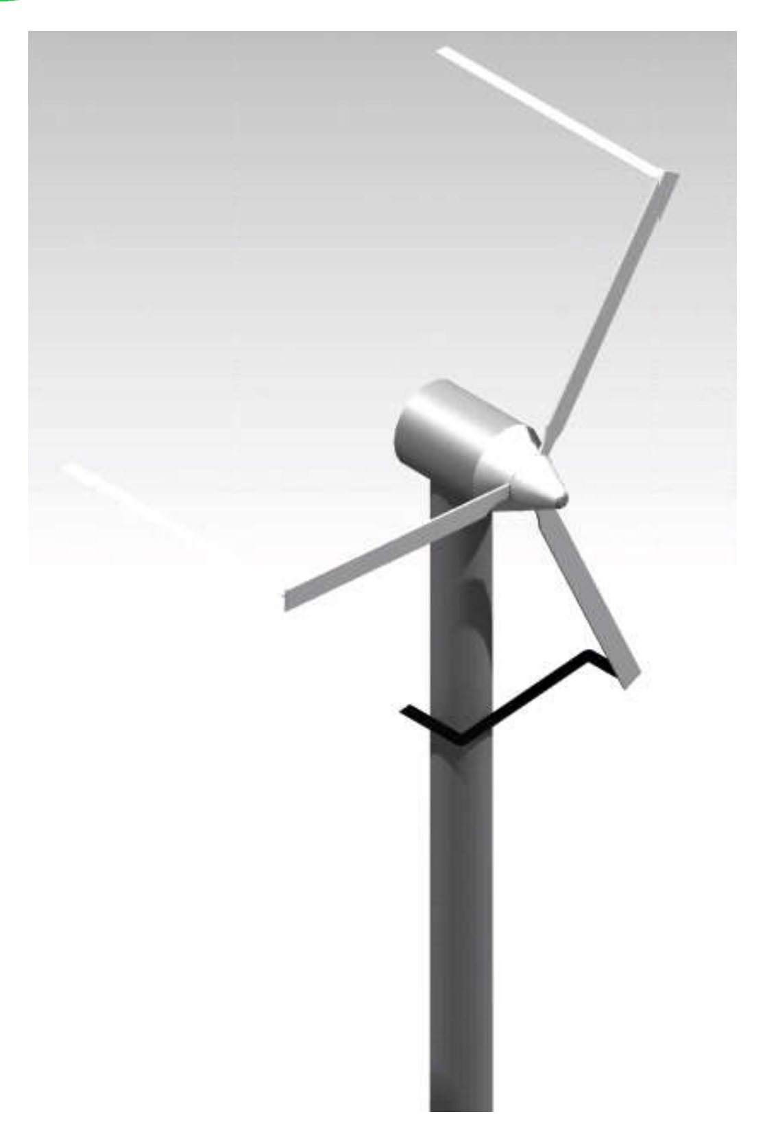
Figure 10 – rotating wind turbine and with wind presence