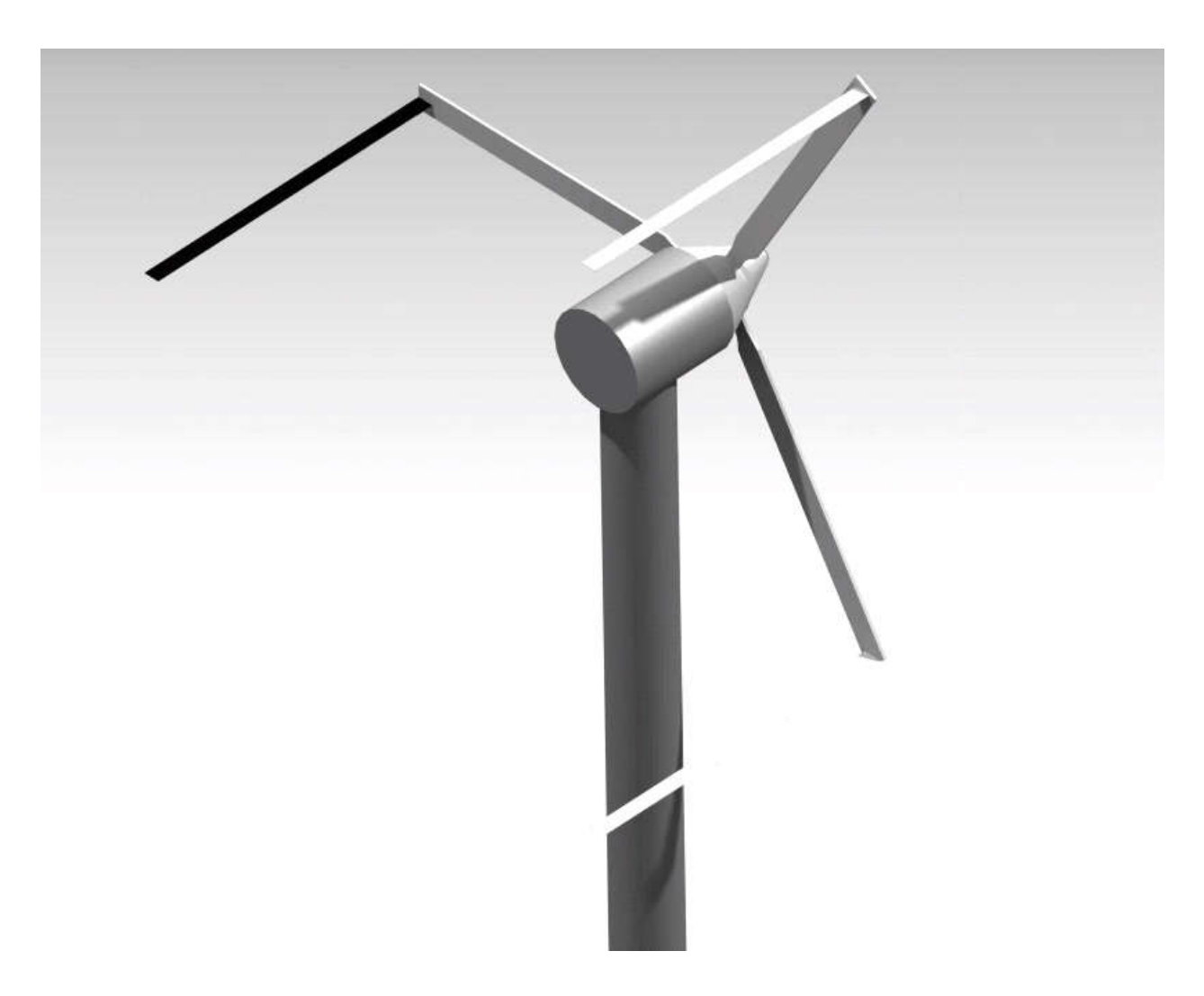
Figure 4 – wind turbine at stationary and with wind presence