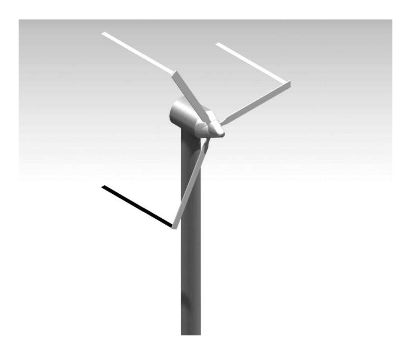
Figure 7 – rotating wind turbine and with wind presence