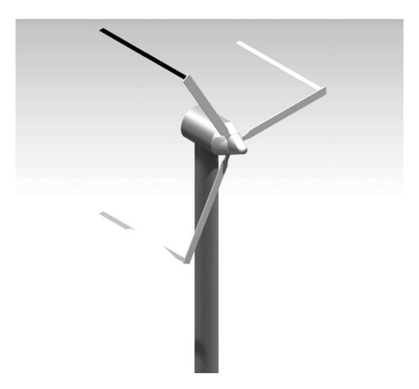
Figure 5 – rotating wind turbine and with wind presence