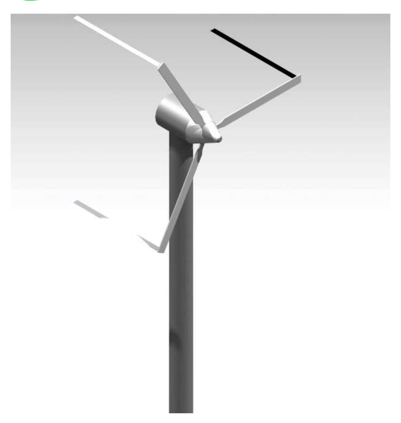
Figure 3 – wind turbine at stationary and with wind presence